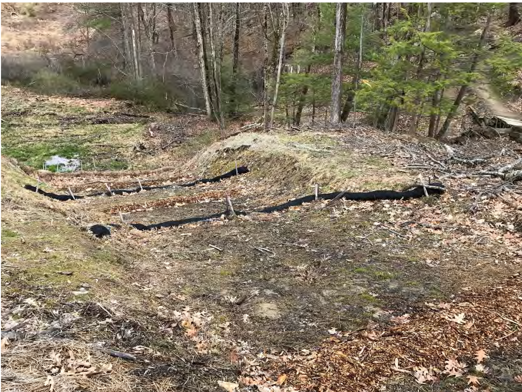
Fig 8: Lower portion of slope between Strs. 28 and 29. Viewing northeast. (04-17-21)