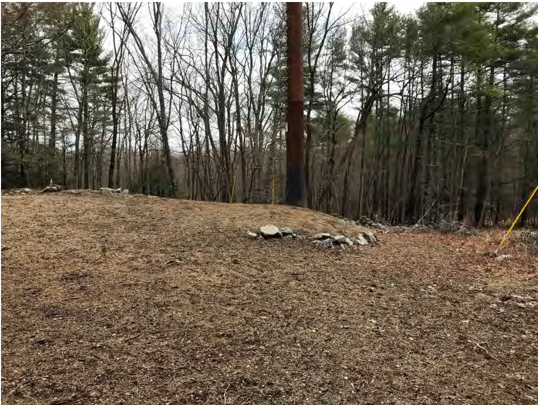
Fig 6: Str. 90 work area. Viewing northeast. (04-17-21)