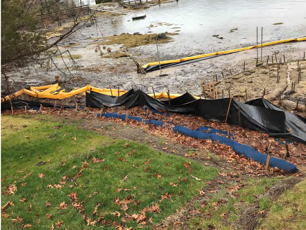
Fig 11: Toe of the slope at Gundalow Landing/east side of the bay. Viewing south. (04-17-21)