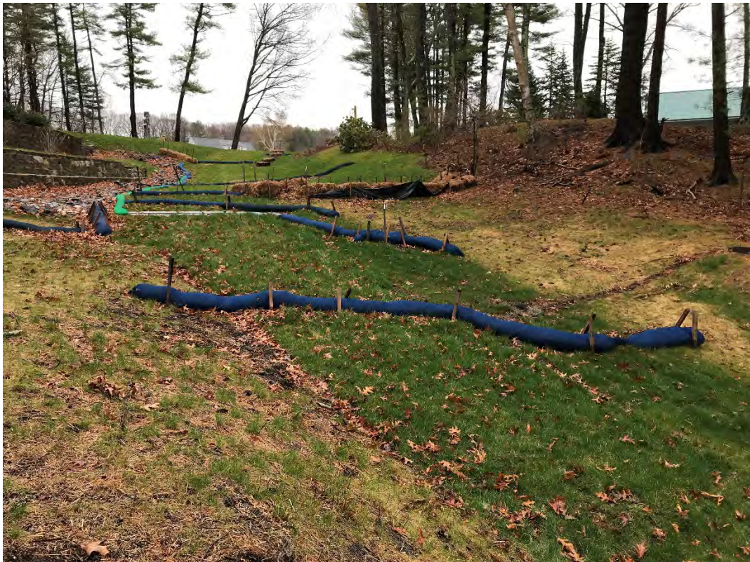
Fig 10: Slope below the manhole at Gundalow Landing/east side of the bay. Viewing east. (04-17-21)