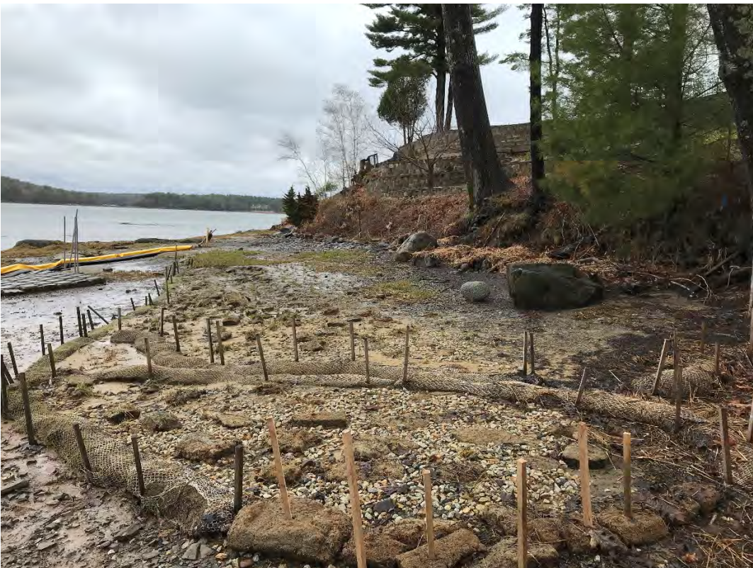
Fig 12: Salt marsh restoration at Gundalow Landing/east side of the bay. Viewing south. (04-17-21)