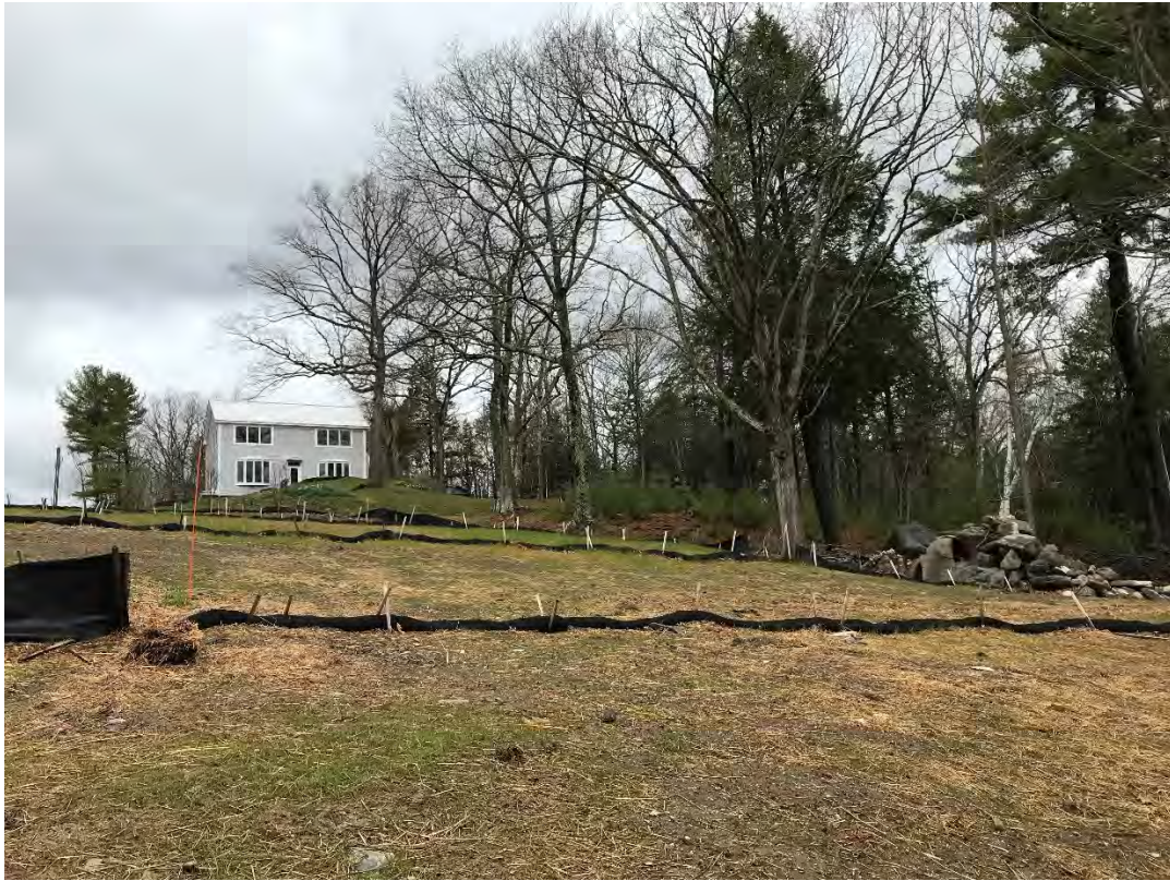
Fig 3: Slope above the cable house at the west side of the bay. Viewing northwest. (04-17-21)