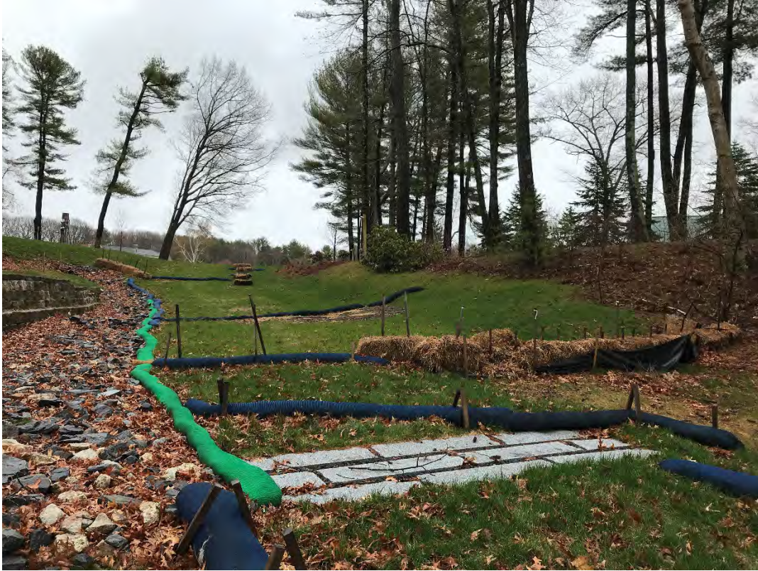
Fig 9: Slope above the manhole at Gundalow Landing/east side of the bay. Viewing east. (04-17-21)