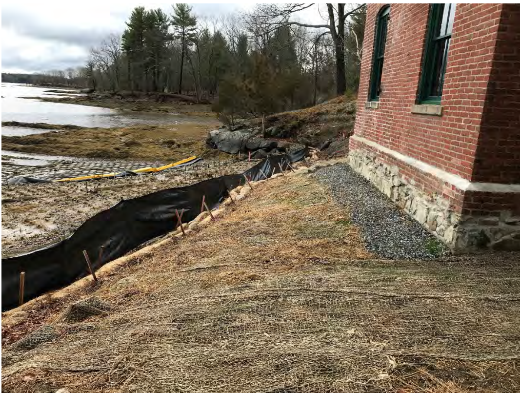
Fig 2: Slope between the cable house and salt marsh restoration at the west side of the bay. Viewing south. (04-17-21)