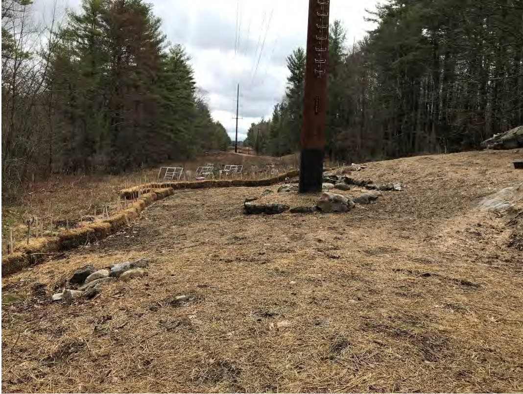
Fig 5: Str. 89 work area. Viewing southeast. (04-17-21)