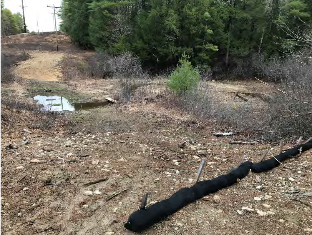
Fig 7: Stream DS46 between Strs. 51 and 52. Viewing northeast. (04-17-21)