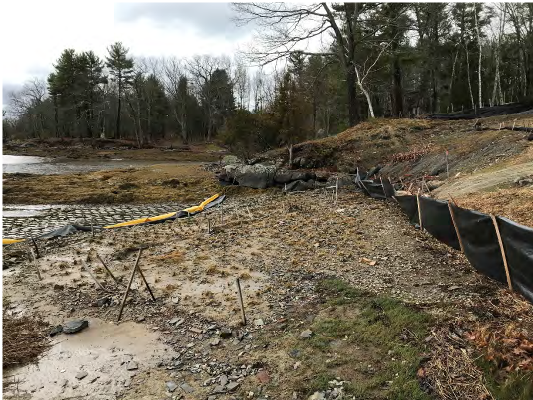
Fig 4: Toe of the slope and salt marsh restoration at the west side of the bay. Viewing south. (04-17-21)