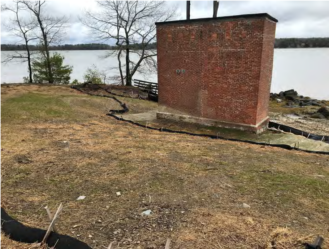
Fig 1: Slope leading down to cable house and salt marsh restoration at the west side of the bay. Viewing northeast. (04-17-21)